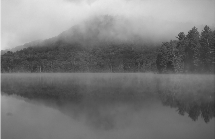
Early morning fog over Grass Pond.

From the landing, hike the yellow trail that follows the left side of Chair Rock Creek. At 4 min, an unexplained blue-marked trail merges from the left; stay straight on the yellow trail. At 11 min, the trail forks;